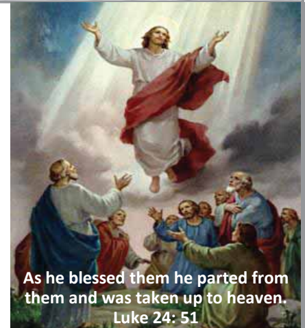
As he blessed them he parted from them and was taken up to heaven. Luke 24: 51

Readings: June 9, Pentecost Sunday: Acts: 2:1-11; 1 Cor 12:3B-7, 12-13; John 20:19-23