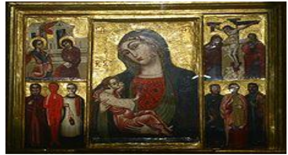
Majka Milost, Trst, Croatia

Traditions holds that on May 10, 1291, angels carried the Holy House of Mary from Nazareth to Trsat, where it stayed until its miraculous transport to Loreto, Italy, 1924. Pope Urban V gave the shire of Trsat an oil painting of the Mother of Mercy with the Christ Child. In 1715, it received the first papal coronation of an image outside Italy. Our Lady of Trsat goes in process on her feast day. May 10th.