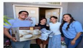
PRIZE 3 WINNER

THANK YOU EVERYONE WHO PURCHASED TICKETS AND FOR YOUR DONATIONS! WE REALLY APPRECIATE YOUR SUPPORT!